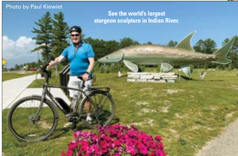
See the world's largest sturgeon sculpture in Indian River.

When you reach Indian River, you've traveled 39.2 miles (from the village of Waters). Situated between Mullett and Burt lakes, Indian River offers several restaurants, shops and lodging options. A paved path along M-68 takes you from the North Central State Trail to the entrance of Burt Lake State Park.