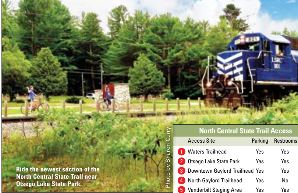
Ride the newest section of the North Central State Trail near Otsego Lake State Park.